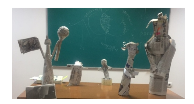
Figure 3 – Examples of dolls created by students in class

Applying Puppet Therapy technology occurs in creative environment, often with humor, laughter therapy involved, in a vivid, spontaneous manner, with decisions coming out suddenly, which is in line with the insight (figure 3).