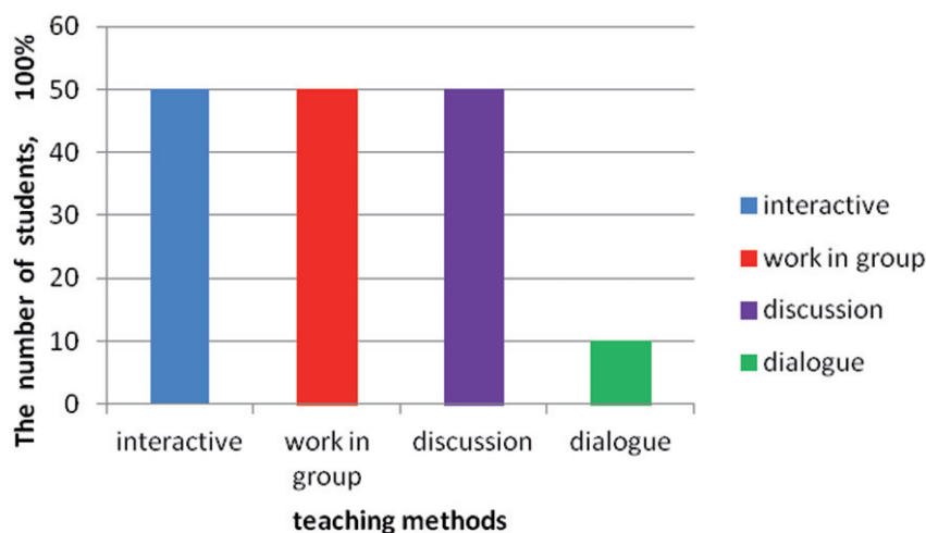
Figure 2 – Students prefer teaching methods, 2013, (a British university)