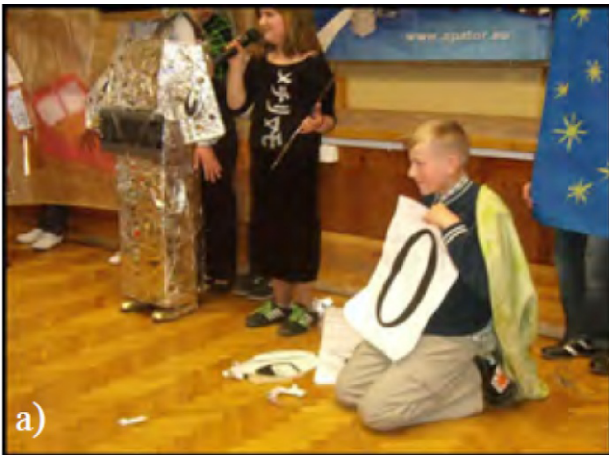
Figure 6a – „Electro-dragon which started to eat the Moon” by primary school students from Zieleń.

whole your imagination to explain it with physical objects. In astronomy we have a kind of dualism: Copernicus said the Earth rotates around Sun, so we keep this picture in our mind, but in reality we see something different – the Sun rises and falls. Should we believe Copernicus (and school teachers) or our eyes?