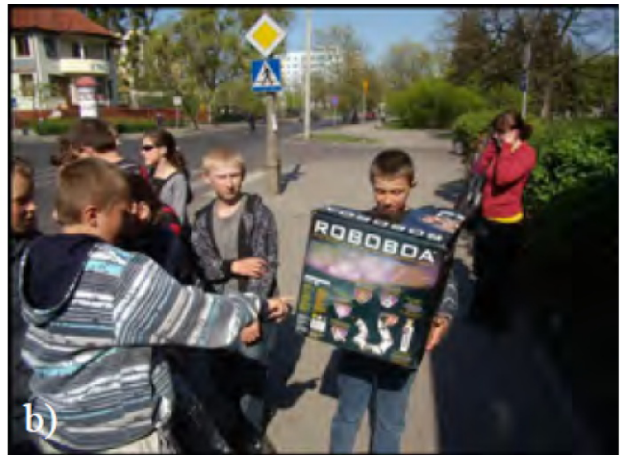
Figure 6b – Proud creators with the prize in their home village