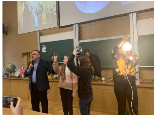
b) Simulating the mechanics of Solar system: Earth rotates in 23h56’, Moon revolves in one month, Sun rotates in 24,5 days