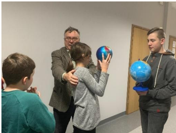
a) Explaining relative sizes of Earth and Moon.

The common goal of these activities is to release creative activity among children through surprising, interdisciplinary activities, by stimulating the unity of action within various arts and sciences. Didactic theater seems to be a great way to stimulate interdisciplinary cooperation of teachers, group cooperation between students and to awaken their fantasies and creativity.