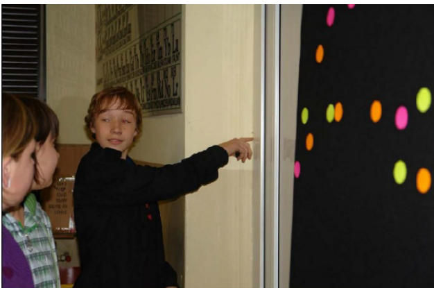
Figure 7a – The lecture „Copernicus in a short trousers”: the experiment with hovercraft used in the didactics of the constant-velocity motion