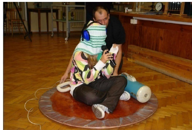
Figure 7b – The student pointing at the Earth (pin head size) in the proposed Solar System model

If we enter into details, a number of questions rises, for “common” people, i.e. those, to whom science divulgation is addressed: why the clock arrows go “clock-wise”? Where should we search planets? How far is the Moon? 11 hours by a rocket, if going on a straight line. How big is Jupiter?