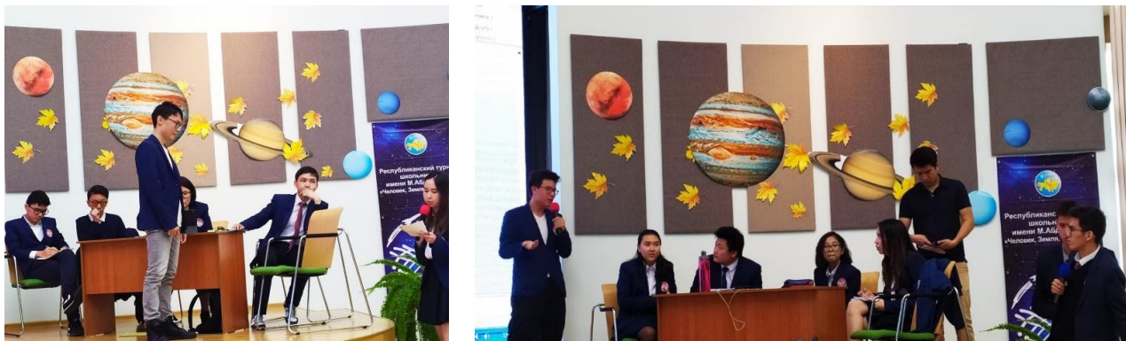
Figure 3 – Schoolchildren of Physics-Mathematics State School are playing role games:

a) A student in the role of «the opponent» is asking the reporter of the opposite group questions