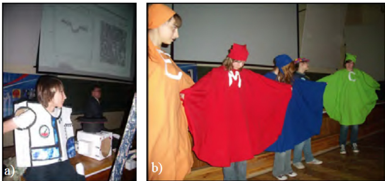
Figure 5 – Fun, didactics and learning in one staging:

send him three instructions. The last one was to make operation “Moon” minus “Moon”= ? See the result on the photo below (fig.6a). Students (and teachers) have shown extraordinary creativity. We brought the team to Warsaw, to the national science festival: Robot’s theatre became a part of the permanent show. Zieleń is a small village, so prize (a working robot) brought them an immense happiness. Didactics is not only the contents on physics, but also opening all possible capacities of the pupil: communication, self-presentation, proud of the place of origin, collaboration in the group, emotions to win (and loose).